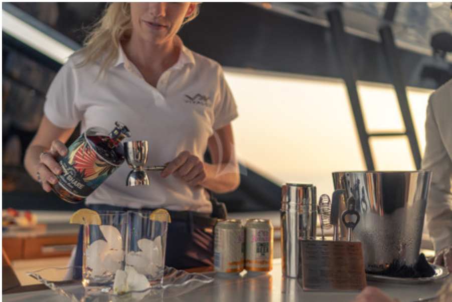
Bar on the sundeck