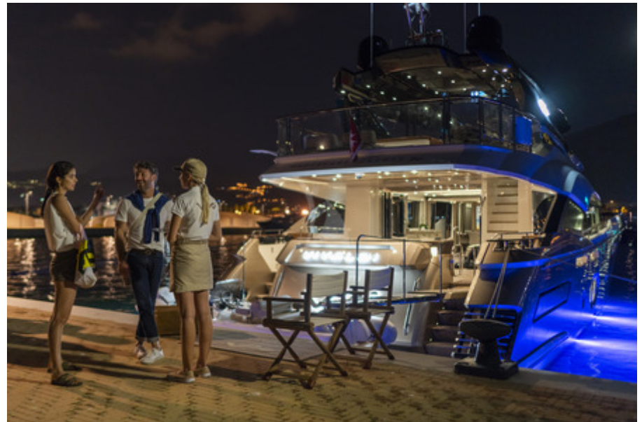
Aft view from the quay at night