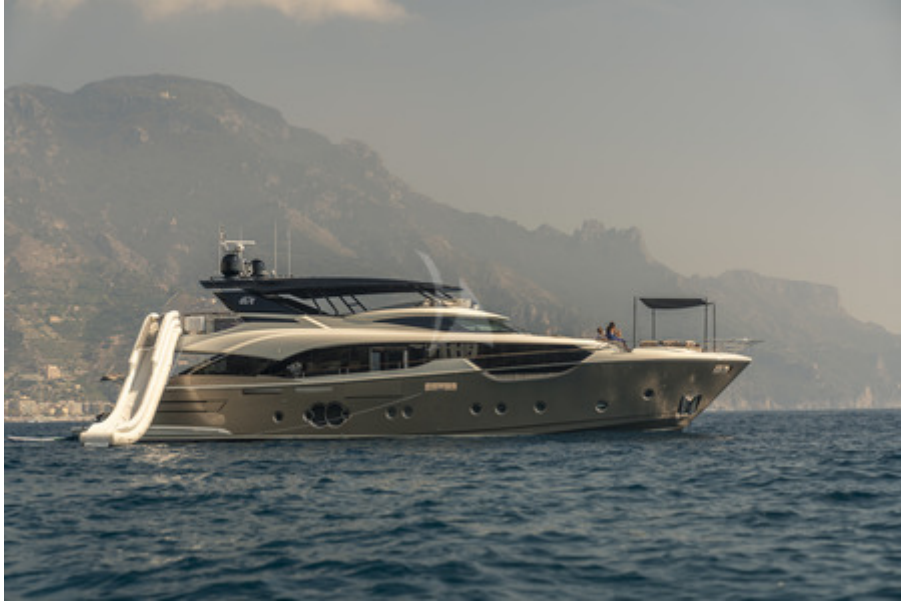
Profile with water toys